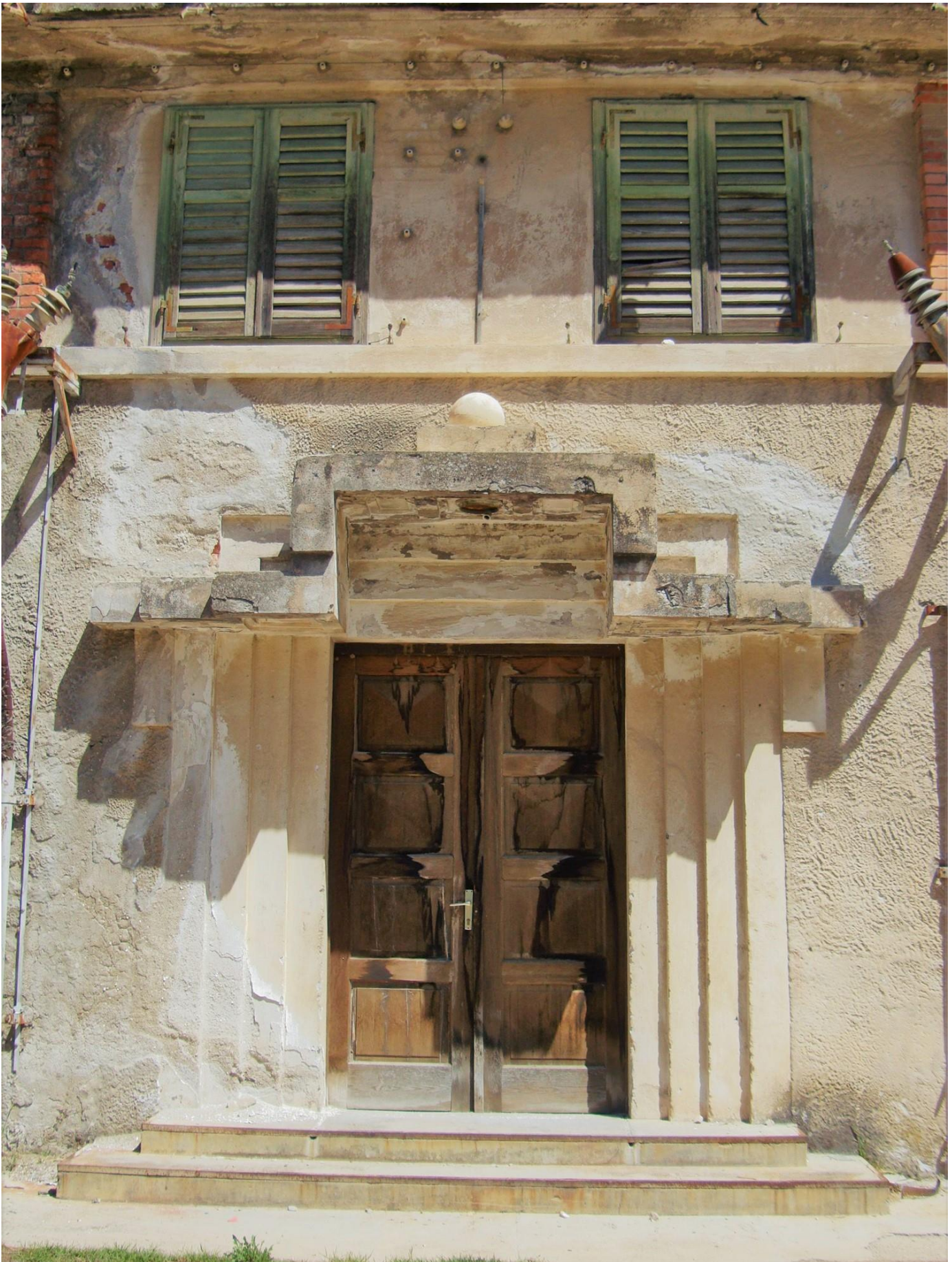
Figure A3.12: The main entrance to Kodl's electrical substation, viewed from the south.