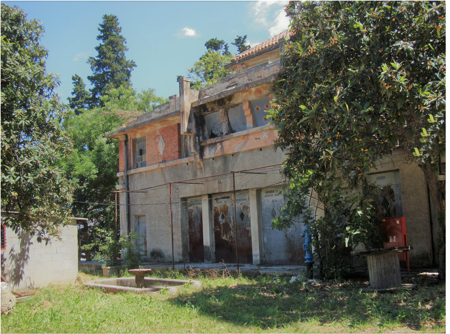
Figure A3.9: Kodl's main electrical substation, view from the west.