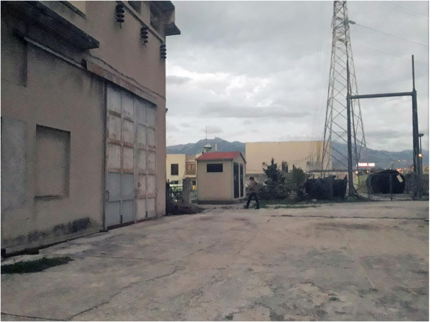
Figure A3.4: The southern section of the auxiliary electrical substation with a transmission line in the background.