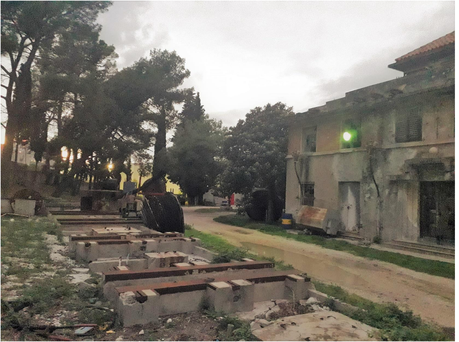
Figure A3.11: Kodl's main electrical substation, southern section.