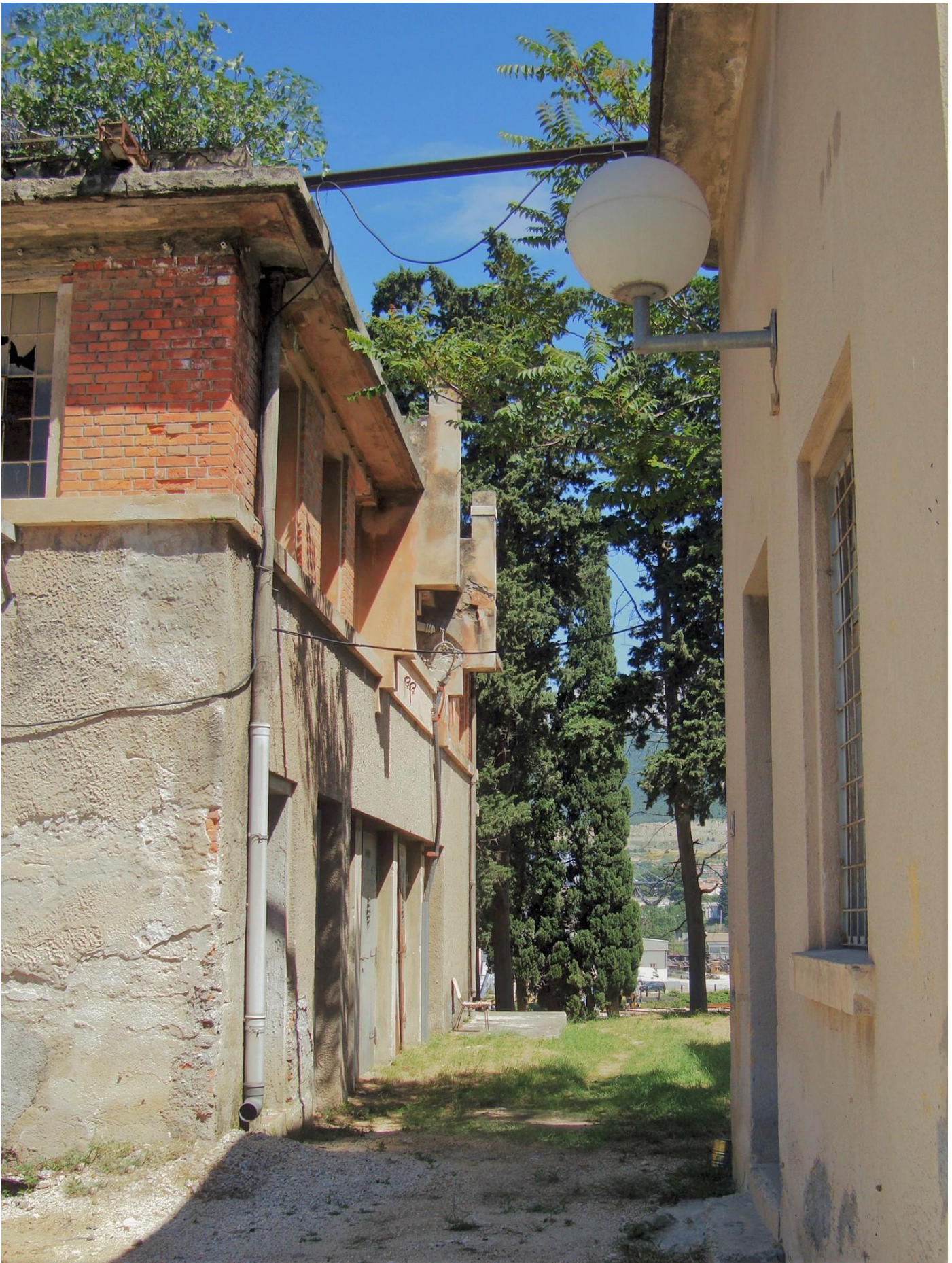
Figure A3.8: The space between Kodl's main and auxiliary electrical substations.