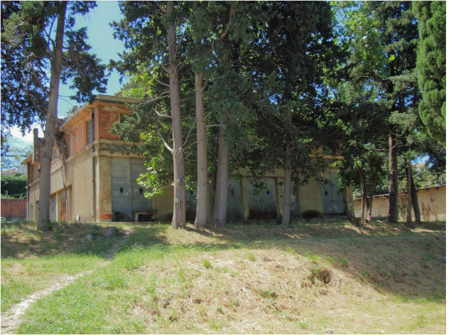
Figure A3.7: Kodl's main electrical substation, view from the northeast.