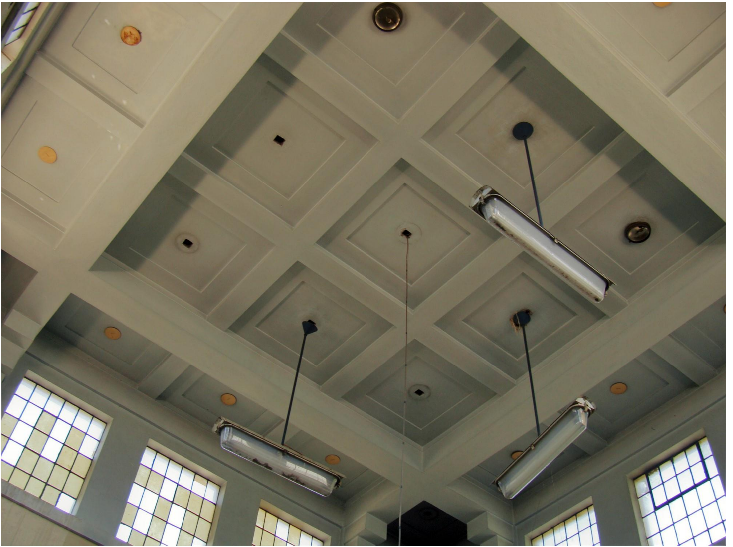
Figure A3.15: The interior of Kodl's main electrical substation.