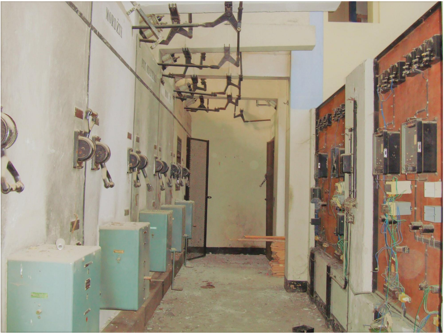
Figure A3.13: The interior of Kodl's main electrical substation.