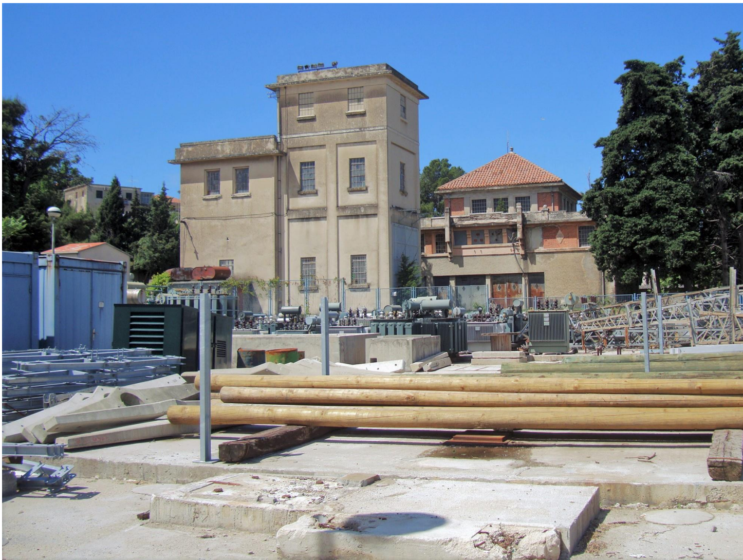
Figure A3.1: Kodl's main and auxiliary electrical substations, view from the east.