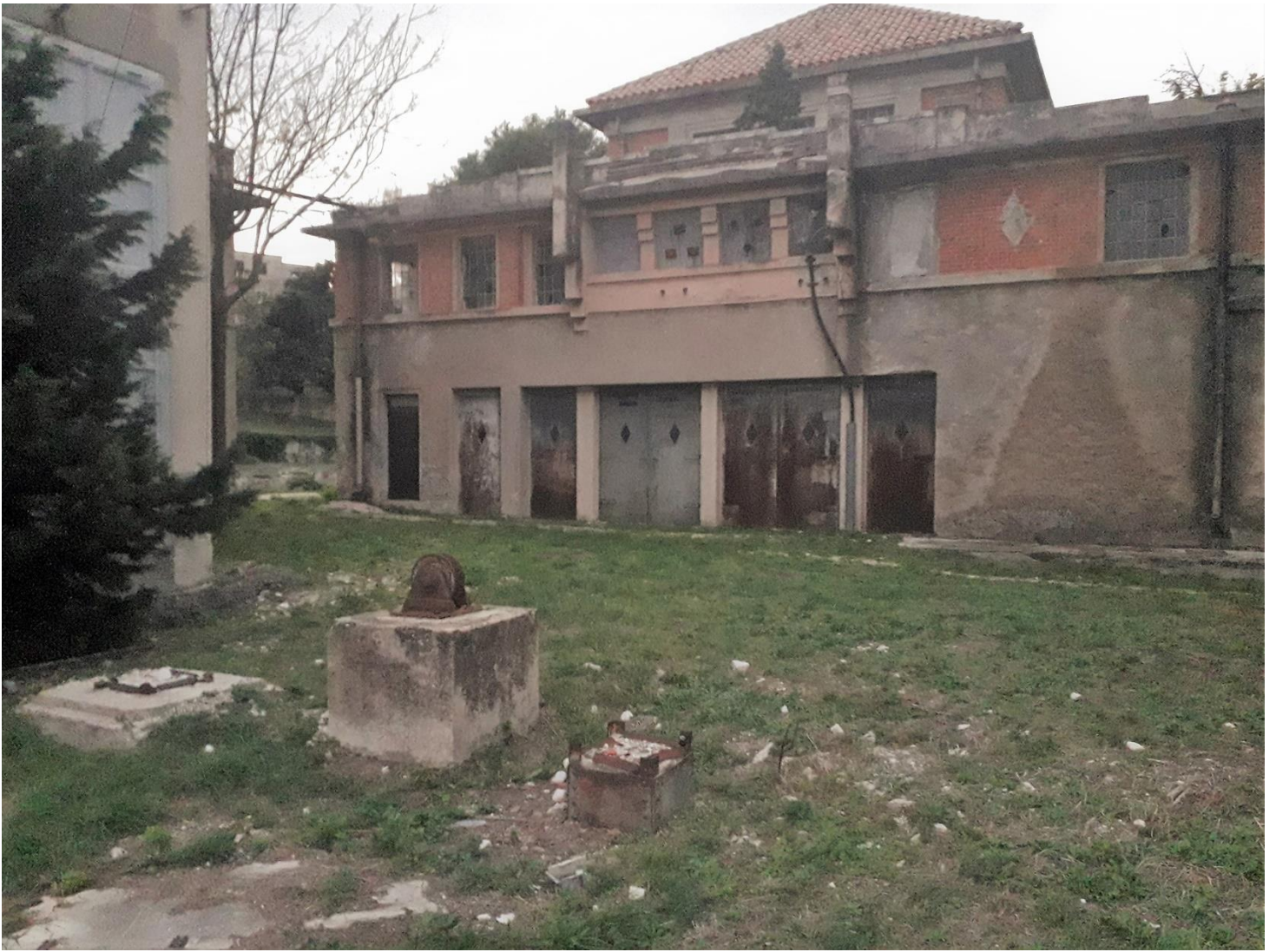
Figure A3.6: Kodl's main electrical substation, view from the east.