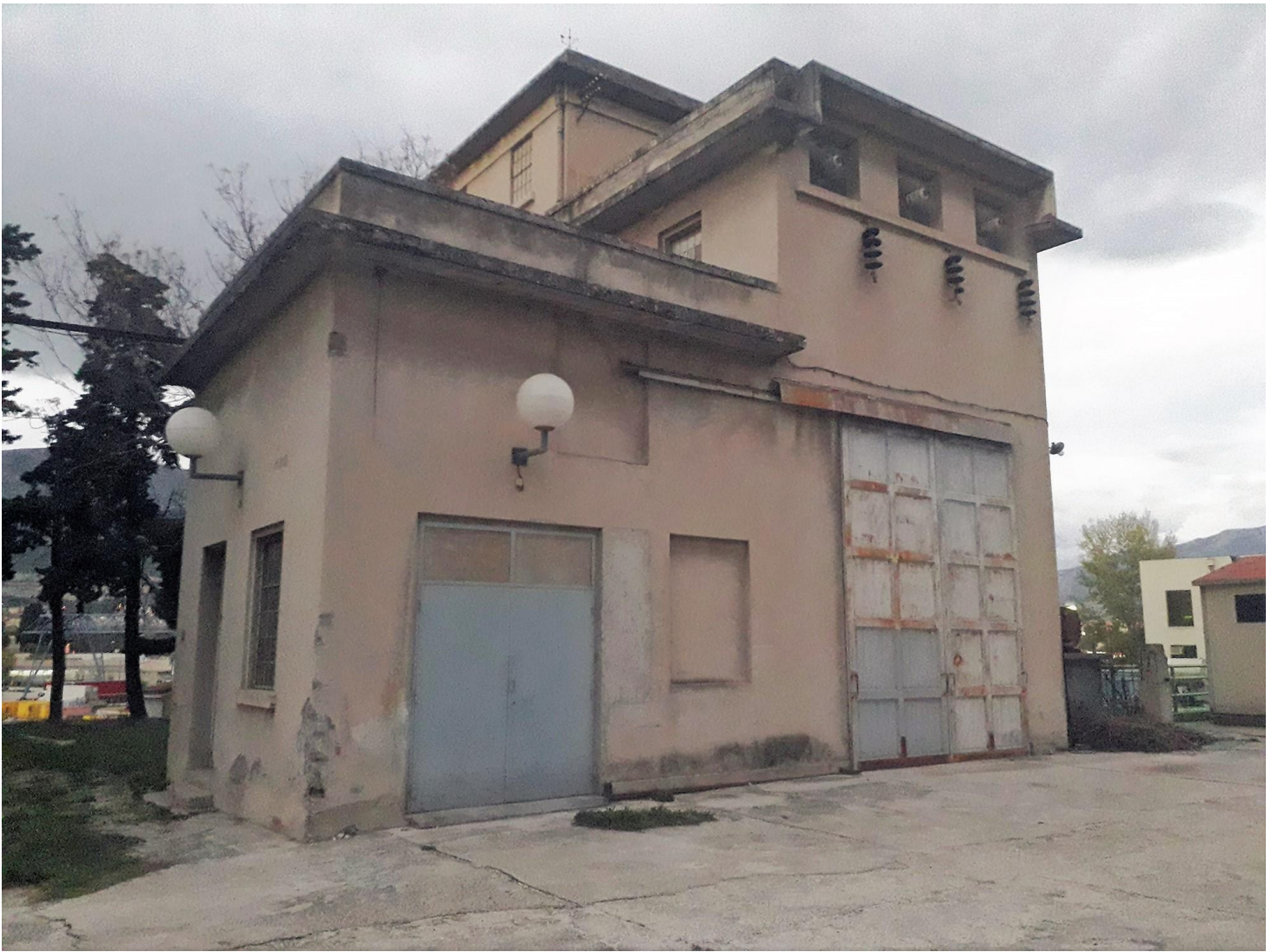
Figure A3.3: Kodl's auxiliary electrical substation, view from the south.