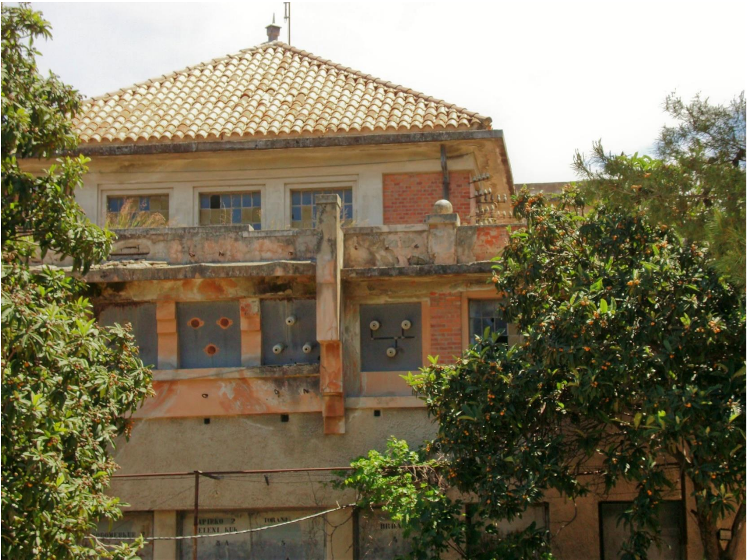
Figure A3.10: Kodl's main electrical substation, view from the west.