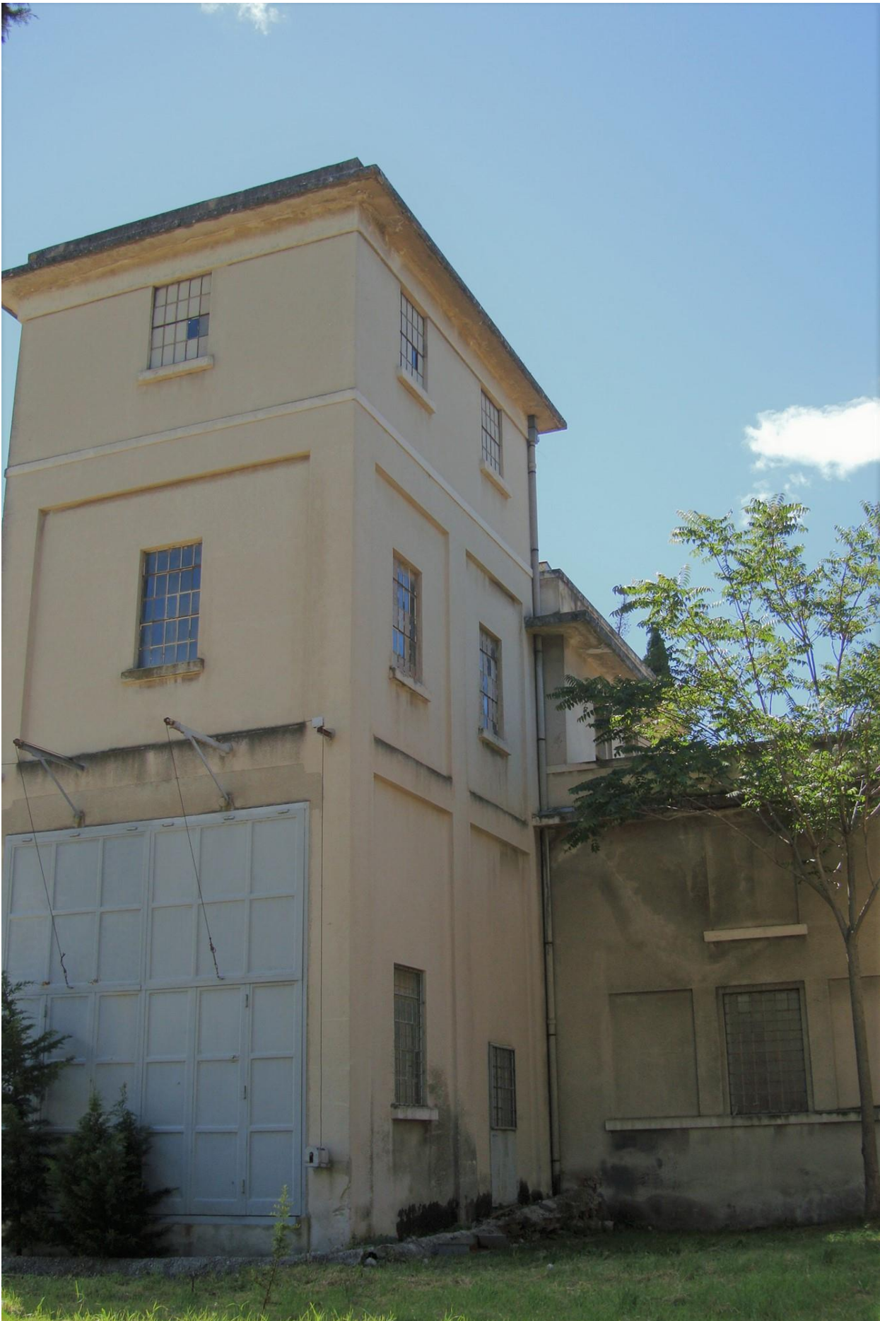
Figure A3.5: Kodl's auxiliary electrical substation, view from the north.