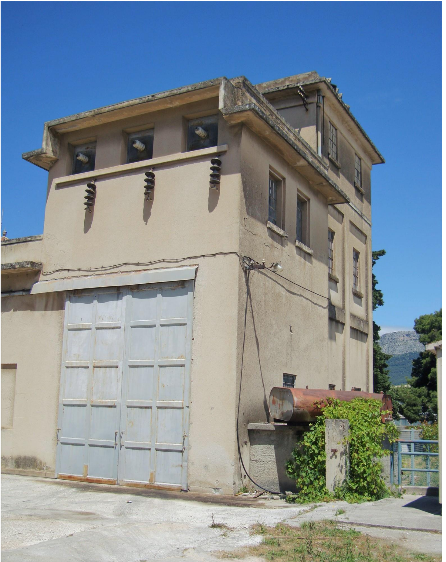
Figure A3.2: Kodl's auxiliary electrical substation, view from the southeast.