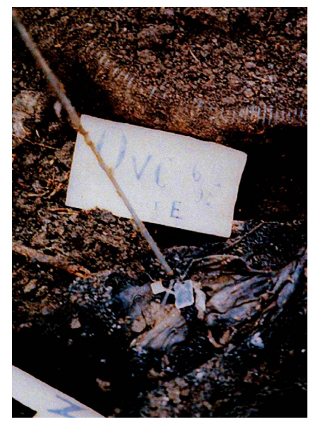
Figure 6. A necklace with Catholic insignia found on a body outside the Ovčara grave [24] (reproduced with permission).

Necklaces with Catholic crosses and a medallion with the inscription "Bog i Hrvati" (God and the Croatians), such as were often worn by members of the Croatian Armed Forces, were discovered on the partially skeletonized bodies of young men that were found outside the grave [34] (Figure 6).