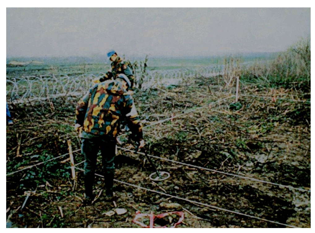
Figure 4. A topsoil security check with a metal detector at, at that time, alleged mass grave site at Ovčara [24] (reproduced with permission).

under the auspices of the UN Commission of Experts, a four-member forensic team deployed by the PHR conducted a preliminary investigation [34]. The investigation began with a security check; simultaneously, aerial footage was taken of the gravesite in its natural environment and the overgrown surface vegetation was then cleared [34] (Figure 4).