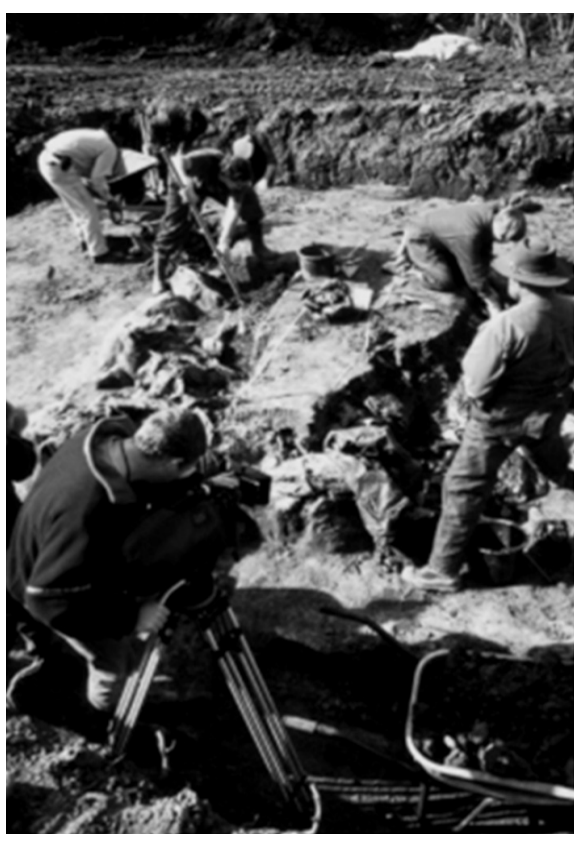
Figure 11. The PHR team manually removes earth from the Ovčara grave [36] (reproduced with permission).

The exhumation began by removing the topsoil mechanically. The black film that was utilized by the first team of forensic experts to protect the skeletal remains from the test trench upon completion of the preliminary investigation in 1992 was uncovered on the third day [36]. The exhumation carried on by manual digging and other archaeological methods to preserve the bodies and evidence [39] (Figure 11).