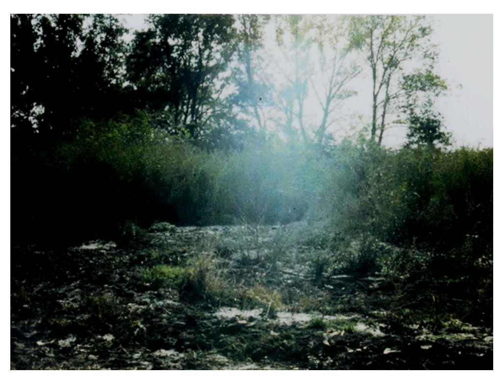
Figure 2. The location of the grave at the Ovčara farmland near Vukovar [24] (reproduced with permission).