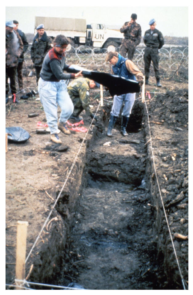
Figure 8. The preservation of bodies from the test trench during the preliminary investigation of the Ovčara mass grave [36] (reproduced with permission).

The preliminary investigation produced detailed documentation on the findings from the exhumation site, exhumation methods, and ex-