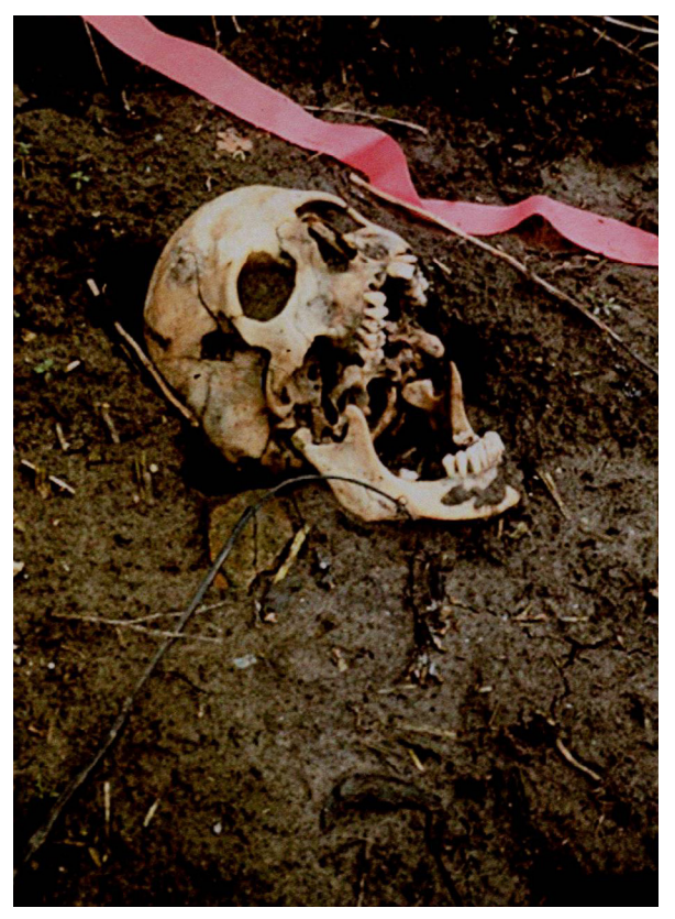
Figure 3. A photograph of the skull on the surface of the Ovčara mass grave [24] ( reproduced with permission).

Upon his return to Erdut, on 18 October 1992, Dr Snow and his entourage launched an investigation into the alleged mass grave site [22] ( Figure 2 ).