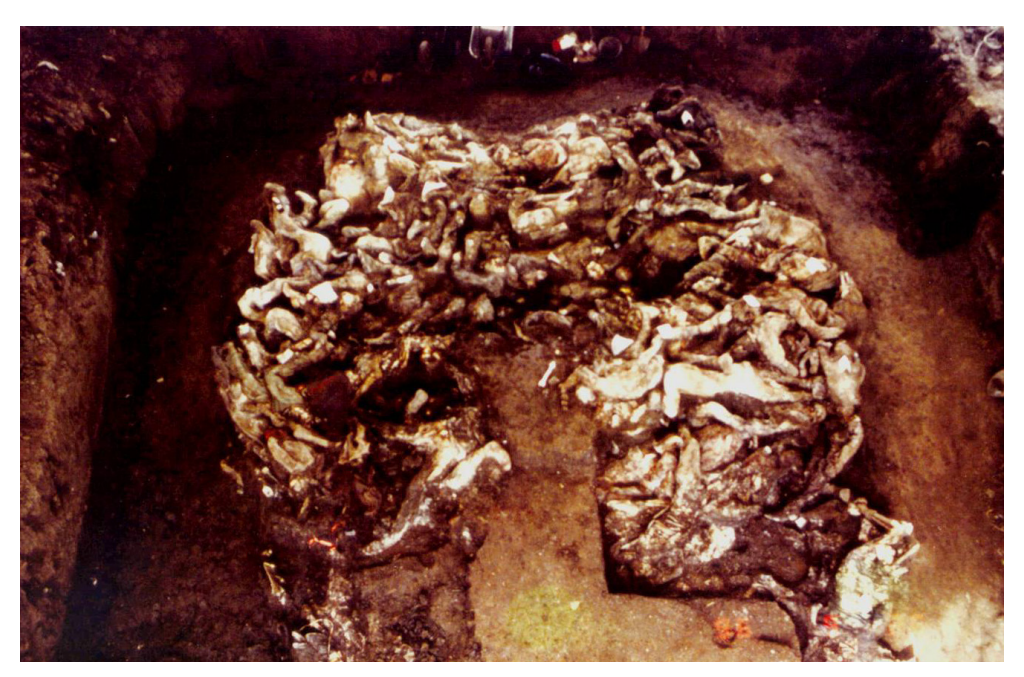
Figure 13. Entangled bodies in the Ovčara mass grave [24] (reproduced with permission).

The first lot of exhumed remains was transported to the Institute of Forensic Medicine in Zagreb for further processing. The last of the 200 victims was exhumed on 4 October 1996 [36].