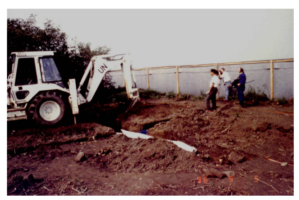
Figure 5. The excavation of the test trench across the surface of the mass grave at Ovčara [24] (reproduced with permission).