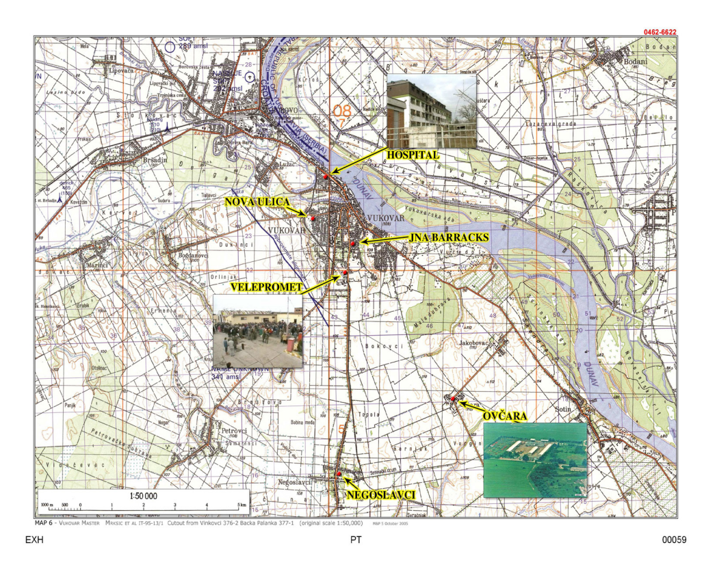
Figure 1. Topographic map of the road leading from Vukovar Hospital to the Ovčara mass grave [30] (reproduced with permission).