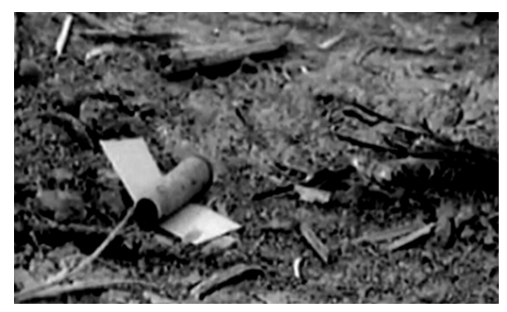
Figure 9. Spent AK47 ammunition on the surface of the Ovčara mass grave site near Vukovar [36] (reproduced with permission).

aminations of the bodies, which was supplemented by hand-drawn sketches as well as photo and video recordings [37] ( Figure 10 ). Following the preliminary investigation, the team's priority was to secure the crime scene; the site was cordoned off with two rows of concertina wire and UNPROFOR Russian Battalion (RUSBAT) guard stations were placed